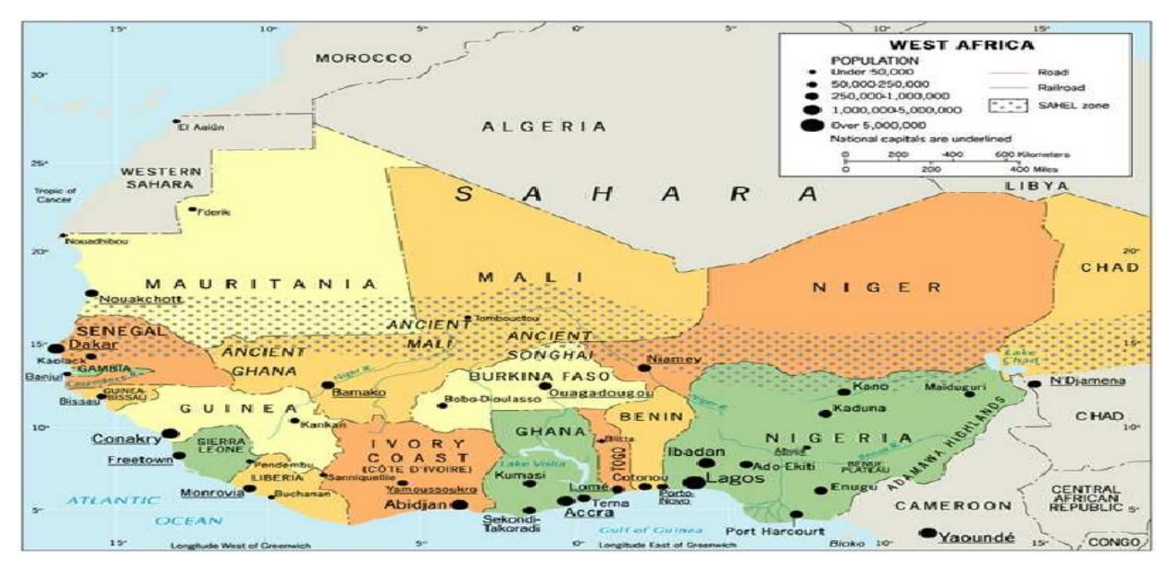
Figure 1: Map of West Africa

West Africa, as the westernmost region of Africa, it has been defined as including 16 countries: Benin, Burkina Faso, Cape Verde, The Gambia, Ghana, Guinea, Guinea-Bissau, Ivory Coast, Liberia, Mali, Mauritania, Niger, Nigeria, Senegal, Sierra Leone and Togo, but for the purpose of this document Chad, Cameroon and Central African Republic are also included (Figure 1). West Africa (from now on including Chad, Cameroon and Central African Republic) covers an area of about 7,000,000 square kilometres and its population is estimated at about 450 million people (Source: Worldometers from latest United Nations estimates).